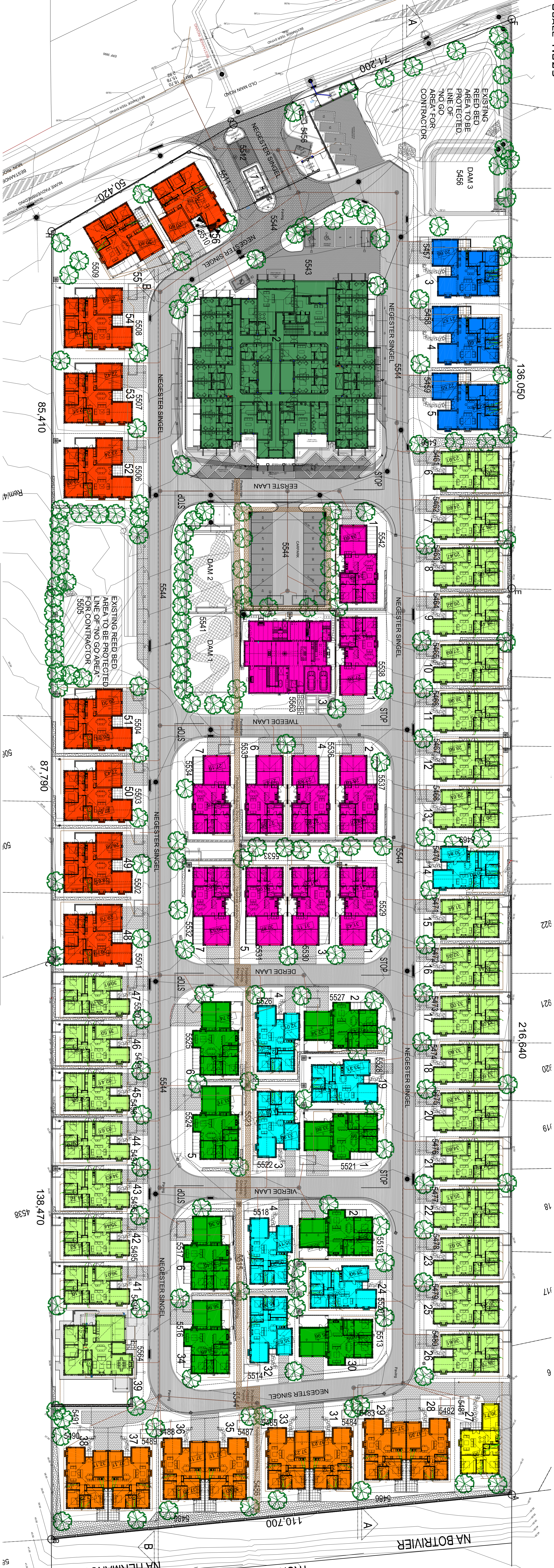
SITE DEVELOPMENT PLAN SCALE 1:325 NEGESTER ONRUSRIEVER LATITUDE : 34° 24' 40.08" SOUTH LONGITUDE : 19° 10' 48.34" EAST