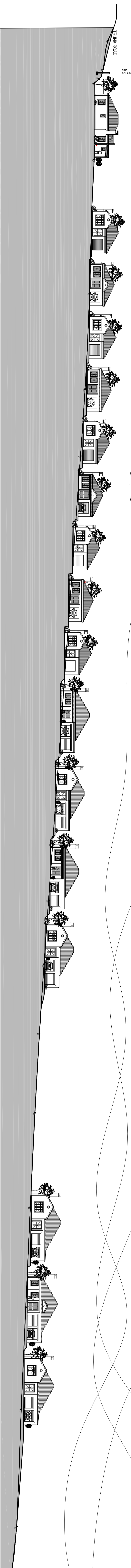
LONGITUDINAL SECTION B-B SCALE 1:325