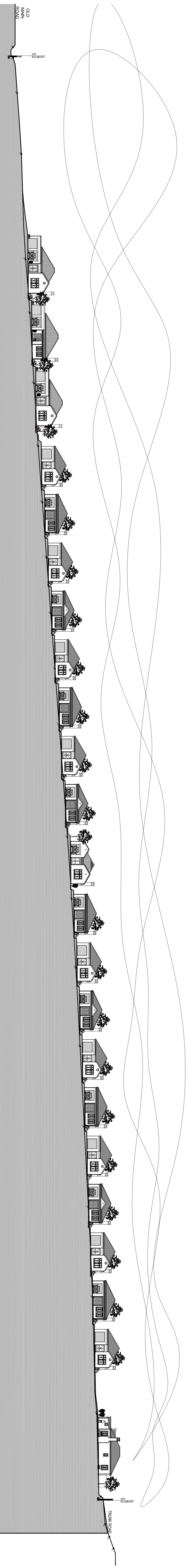
LONGITUDINAL SECTION A-A SCALE 1:325